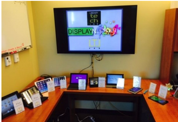
The "Display 'N Play" area of the library's new Technology Lab, where visitors can explore new technology available for circulation.

On November 20, 2014 the library opened its new Library Technology