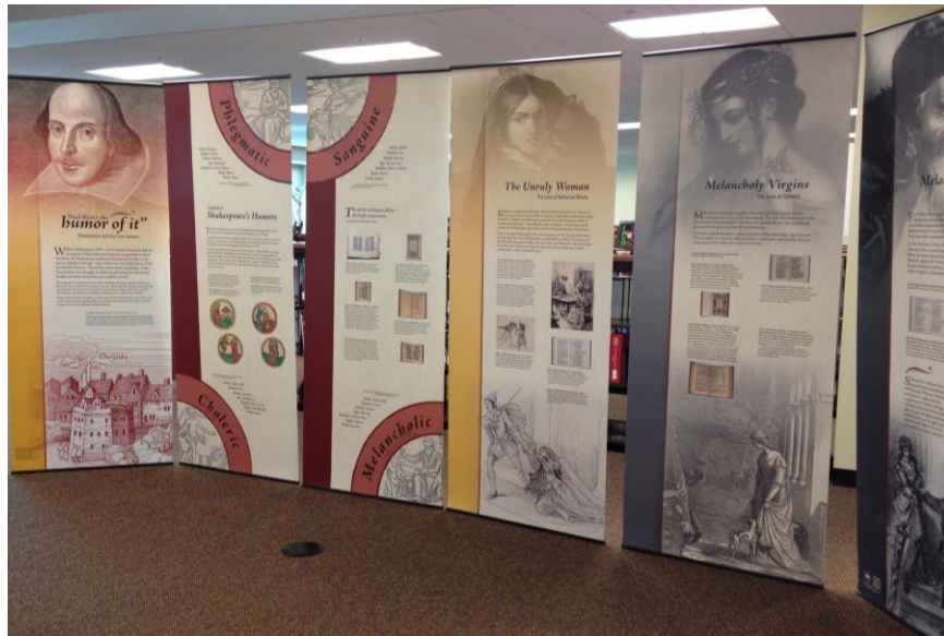
NLM traveling exhibit, “And There’s the Humor of it: Shakespeare and the Four Humors” at display in the Harriet F. Ginsburg Health Sciences Library.

The NLM traveling exhibit, “And There’s the Humor of it: Shakespeare and the Four Humors,” is now on display at the Health Sciences Library. The exhibit examines the medical history and literature of the four humors—phlegm, blood, yellow bile, and black bile—which were thought by Shakespeare and others to define one’s health and personality. The exhibit will be at UCF COM until August 31, 2013.