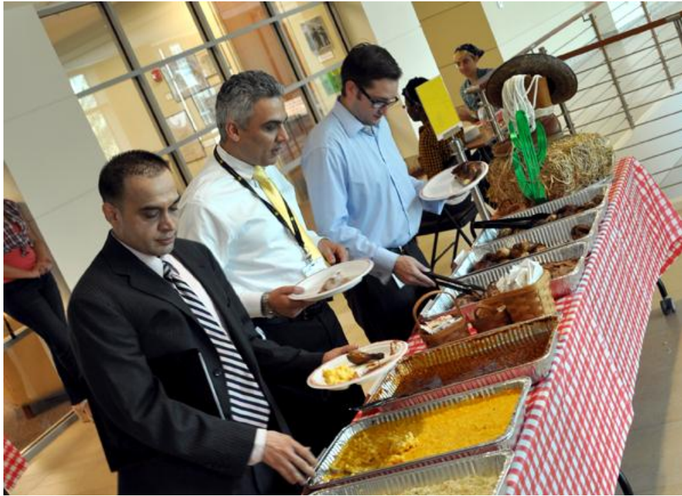
UCF College of Medicine faculty at the buffet table during the library's annual Faculty Appreciation Luncheon.