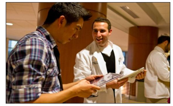
Second-year UCF medical students receive their iPads.

The Harriet F. Ginsburg Health Sciences Library is embarking on a two-year study on the use of mobile technology in medical education. All students and many of the faculty members at the University of Central Florida College of Medicine are now using the Apple iPad. The library's iPad study team is in the process of receiving IRB approval to conduct their research, which will examine how the school's students and faculty are accessing and using library resources on the iPad. The library has been instrumental in encouraging the use of mobile devices at the medical school.