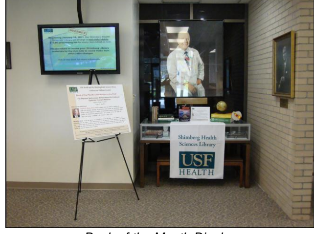
Book of the Month Display