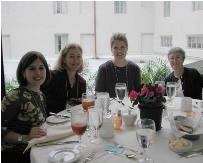
Fine food, good friends...